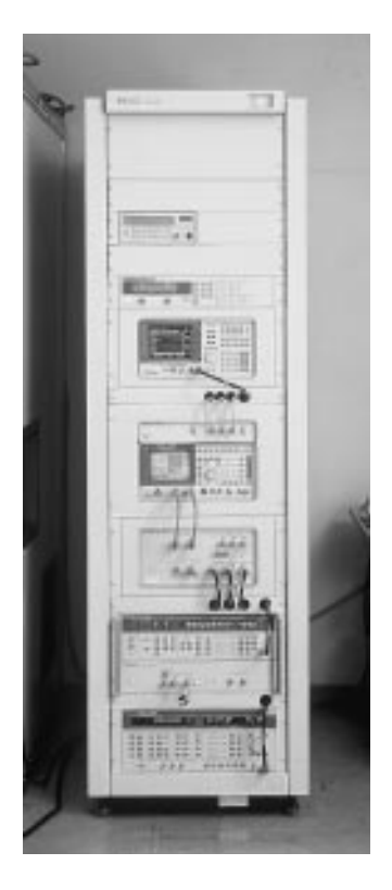
PHS custom test system

The PHS standard includes required performance tests and test procedures for personal stations and cell stations. HP has been working closely with PHS radio manufacturers to develop equipment and application soft-