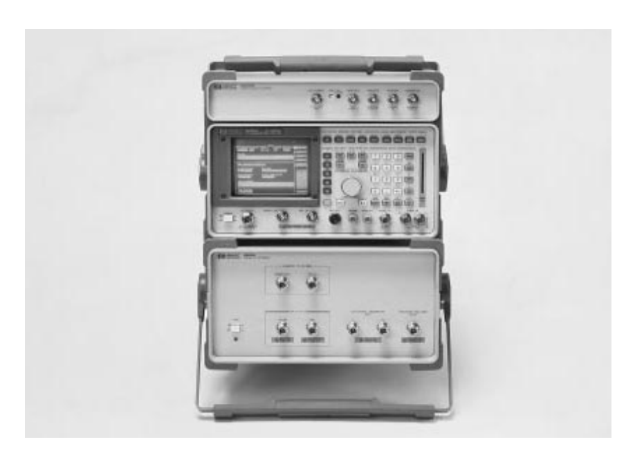
HP 8920 DT digital RF communication test set

The following paragraphs descibe some of HP's PHS test products.